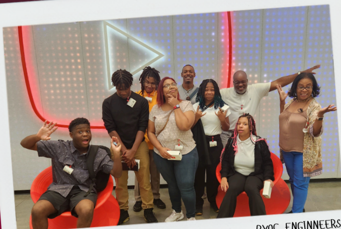
"TOUR OF YOUTUBE"